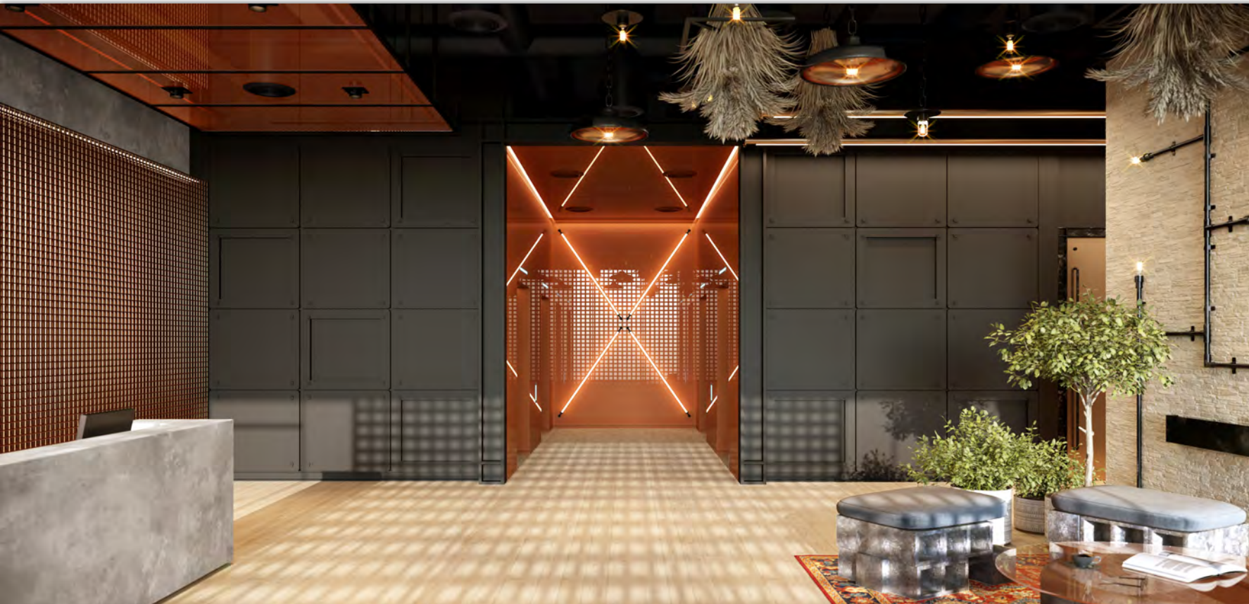
You will feel immediately the sense of relaxation and leisure when you enter this place.