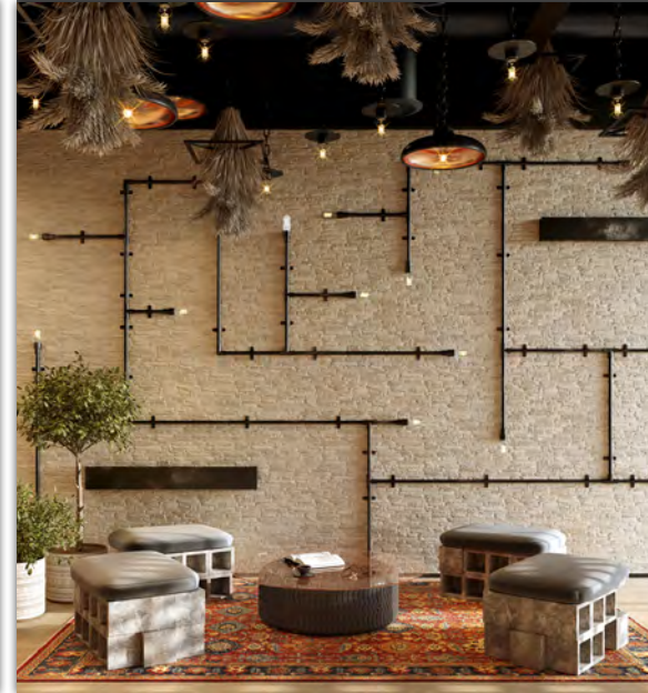
From the moment you step inside, you will feel the strong sense of homeliness and the relaxing natural colours.