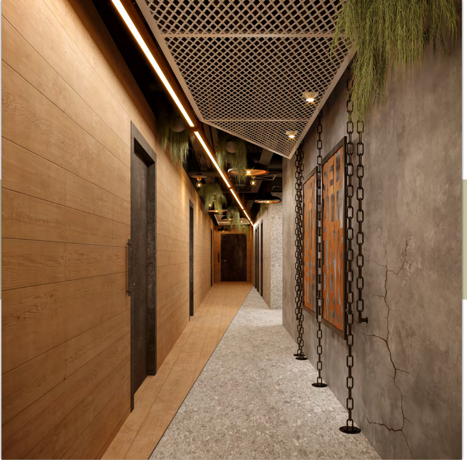
Vision of industrial style in mind